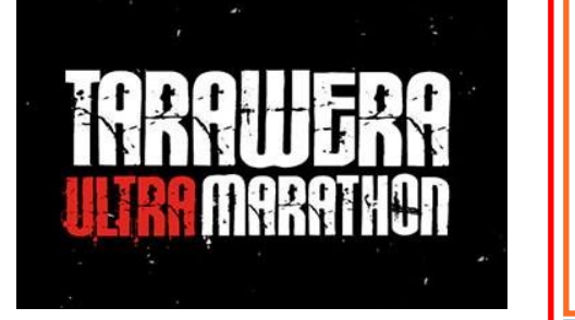
Tarawera UltraMarathon is an iconic trail running event held in Rotorua, New Zealand's birthplace of tourism.

Lots of music, fun and entertainment the Night Market is on every Thursday evening from 5pm to 9pm (weather permitting) in the 'Heart of Tutanekai Street' (between Haupapa and Hinemoa Streets.)