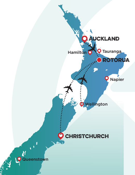
DRIVE TIMESAuckland:3.0 HrsHamilton:1.5 HrsTauranga:1.0 HrWellington:5.5 Hrs

"If you have visitors, they are just blown away by the variety of experiences and the laid-back nature of this place."